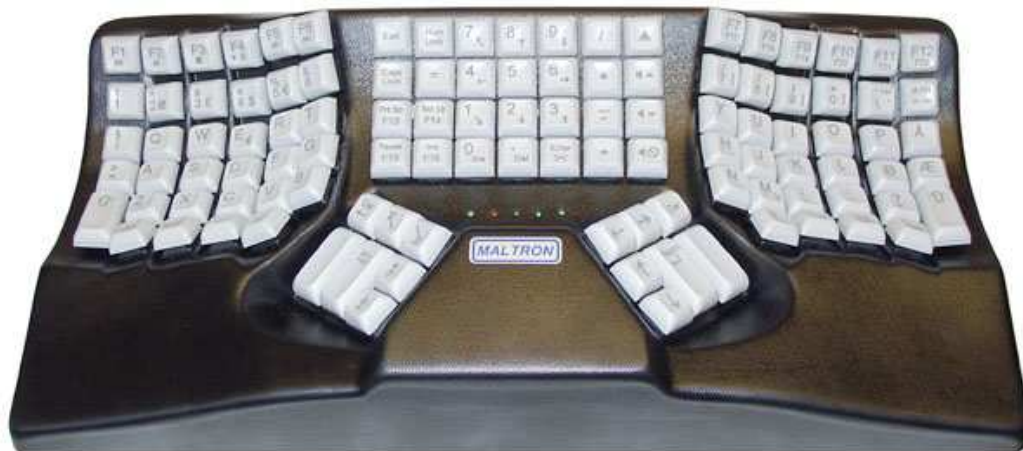
L90 NO Keyboard (in optional black).