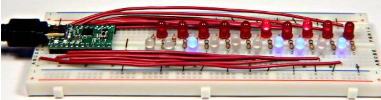
The Teensy with header pins is easy to use with a solderless breadboard

The Teensy is available with header pins , for direct no-soldering-required use on a breadboard, which can also be run from the +5 volt from the USB cable . Standard Teensy boards come with solder pads. Either way, all Teensy boards come fully assembled and tested, so no surface mount soldering is needed.