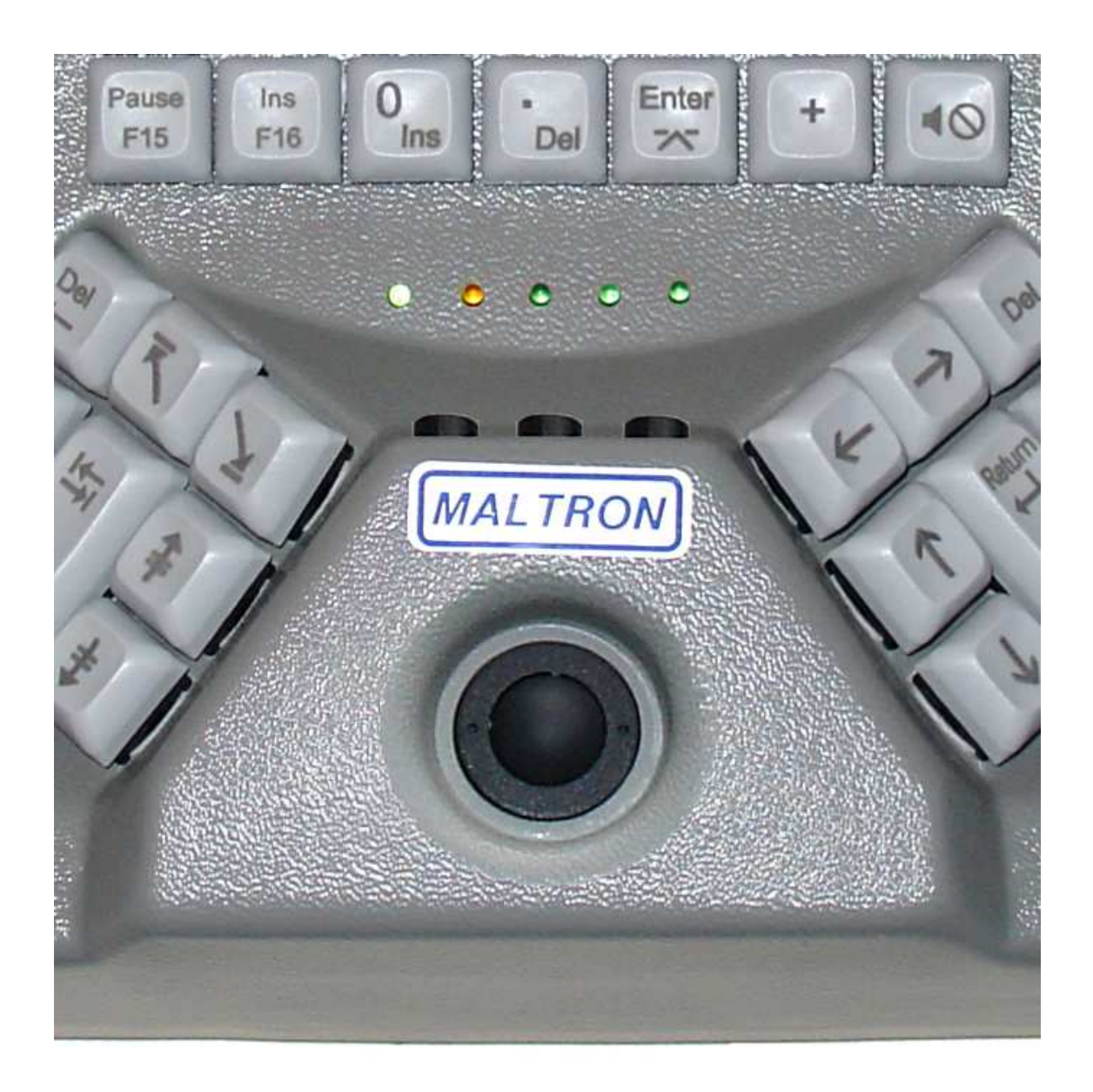
Trackball mounted in central palm rest with three buttons above.

The Maltron L90 3D ergonomic keyboards are optionally available with a built in trackball with a two button mouse emulation.