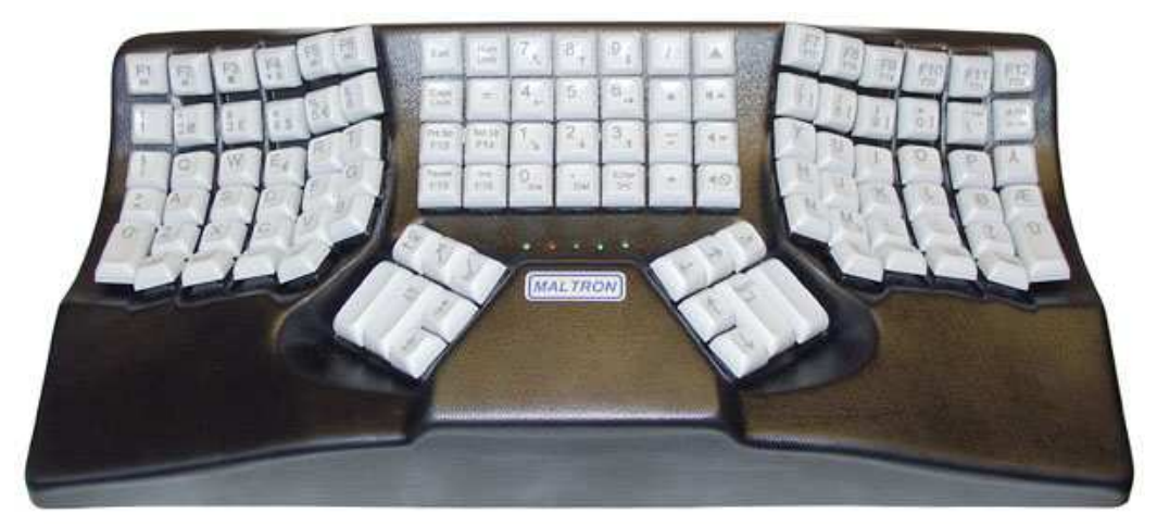
L90 SE Keyboard (in optional black). (N.B. Draft HB shows NO keyboard.)